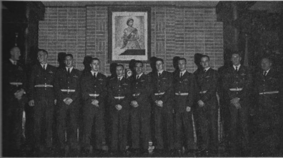
FIRST VISIT TO OFFICERS' MESS — COURSE 6108 RO