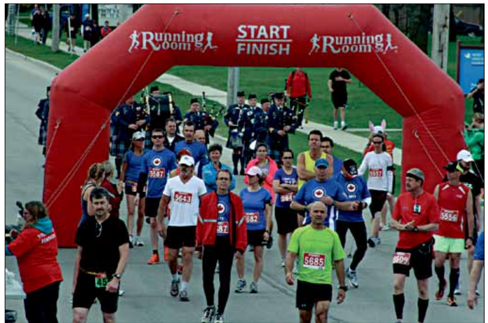
Participants make their way to the starting line at last year's RCAF Run.