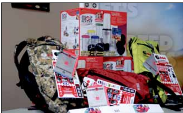
The prizes for the Health and Wellness Challenge.