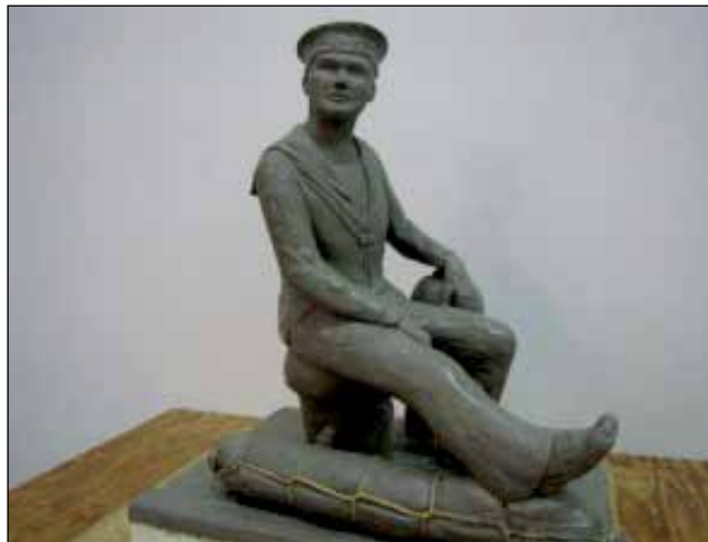
A model created by Helen Granger Young, of the soon to be unveiled Prairie Sailor statue.

The Battle of Atlantic was fought continuously in the North Atlantic from 1939 until 1945 and was very much a three dimensional theatre of battle involving submarines, ships and aircraft. However, unlike the other bat-