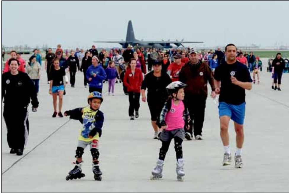
Members of 17 Wing and their families make their way along the flight line as part of the 2013 RCAF Run Family 5 km walk/run.

In the spirit of connecting with Canadians and promoting fitness, on May 25th, 17 Wing is hosting the 6th annual RCAF Run. This year, in order to underline the 90th anniversary of the RCAF, as Wing Commander I