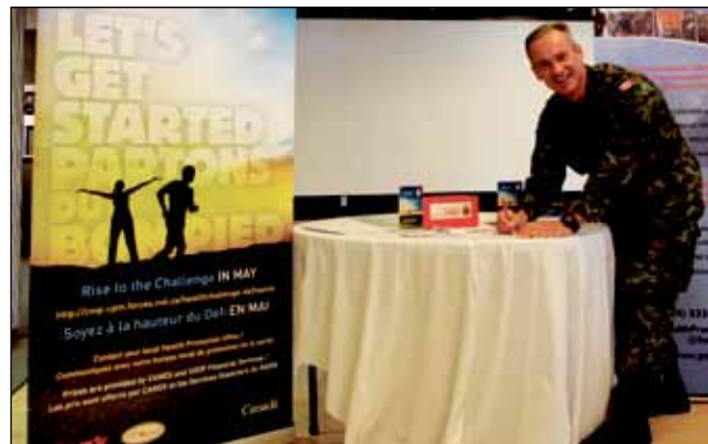
WCWO Normandin signs up for the CAF Health and Wellness Challenge.

"Every choice we make as a part of daily life makes a big difference to our overall health," says Health Promo-