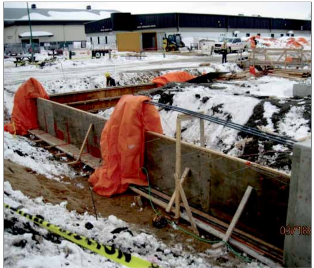
Construction in progress at the new CANEX building in March 2014.

"What really made a huge difference was having the project managed locally, with people that were personally invested in seeing this coming to fruition. I think this will anchor and be a great addition to the Member Support Village."