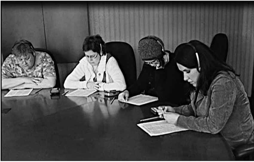
The workshop "Hearing Voices that are Distressing" in session.

"Please be advised that this workshop is very intense