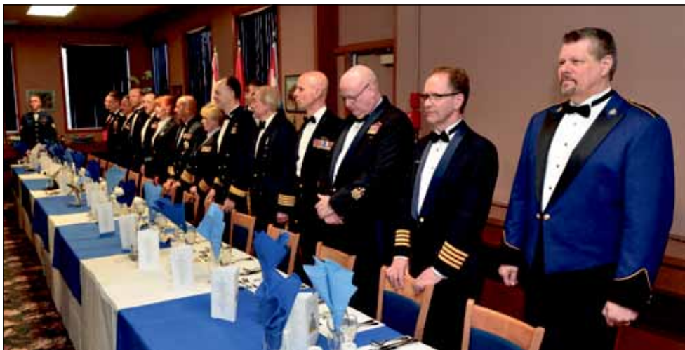
The head table at the 90th Anniversary of the RCAF Mess Dinner included representatives of the RCMP, the Winnipeg Police Service, former and serving Honorary Colonels, 1 and 2 Canadian Air Division Command Teams, and the 17 Wing/AFTC Command Team.