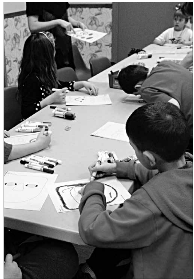
There will be lots of fun activities for kids to take part in at the Active Kids open house, May 6th, 2014.

The open house takes place in Building 33, the WestWin Community Centre, Tuesday May 6th from 4:30 - 7:30 PM.