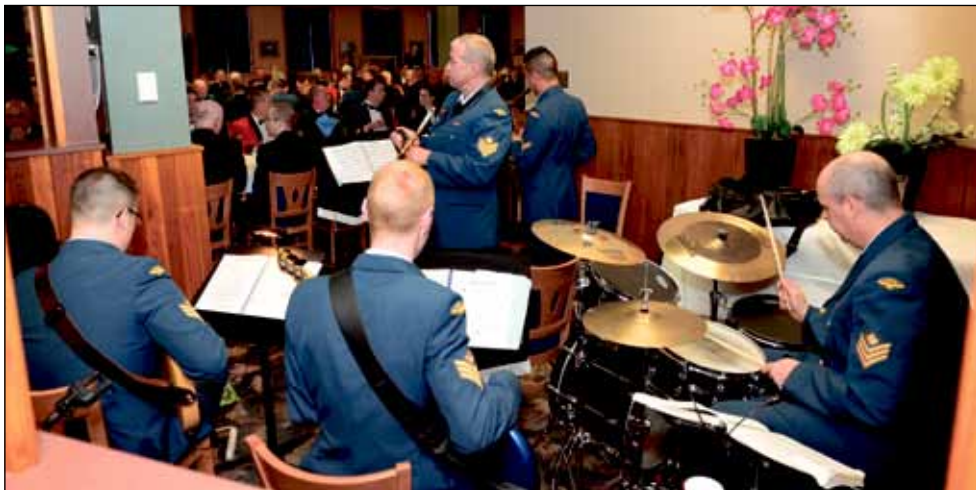
The RCAF Band plays during the meal.