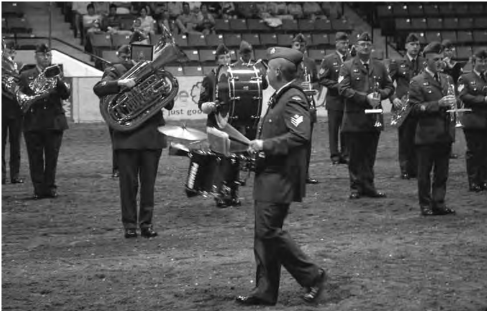
The Air Command Band entertains the audience during the Heritage Tattoo in Brandon.

One by one, the names of the fallen were read as each member rappelled from their position and made for the main stage, planting a flag and raising a hand in salute.