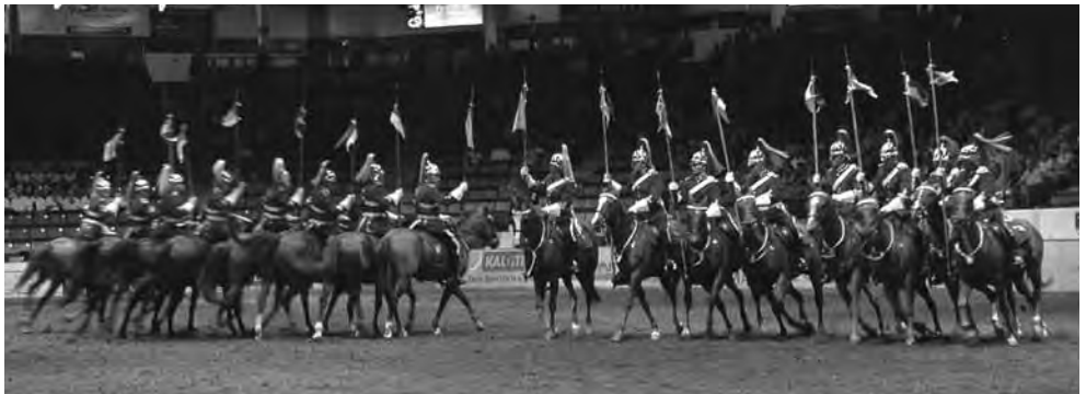
Members of Lord Strathcona's Horse performing a crowd favourite, the Windmill.