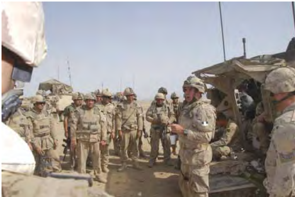
Les directives du sergent-major aux membres de l'échelon avant le réapprovisionnement des troupes.

Après une dizaine de journées intensives à travailler jour et nuit avec constamment l'idée en tête d'aller prendre une bonne douche et de boire de l'eau fraîche, nous sommes retournés sur nos camps respectifs pour aller reprendre nos forces. Une tâche accomplie sans problème majeur. Cette opération nous aura permis de nous garder occupé afin de nous rapprocher progressivement de notre date de départ de l'Afghanistan.