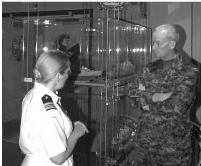
MGen Tabbernor and LCdr Heuthorst tour the Naval Museum of Manitoba.

"We're hoping that everyone inside the Base, and the Winnipeg media, will participate in both events, and so we're combining them together for maximum impact," says Maj Schwindt.