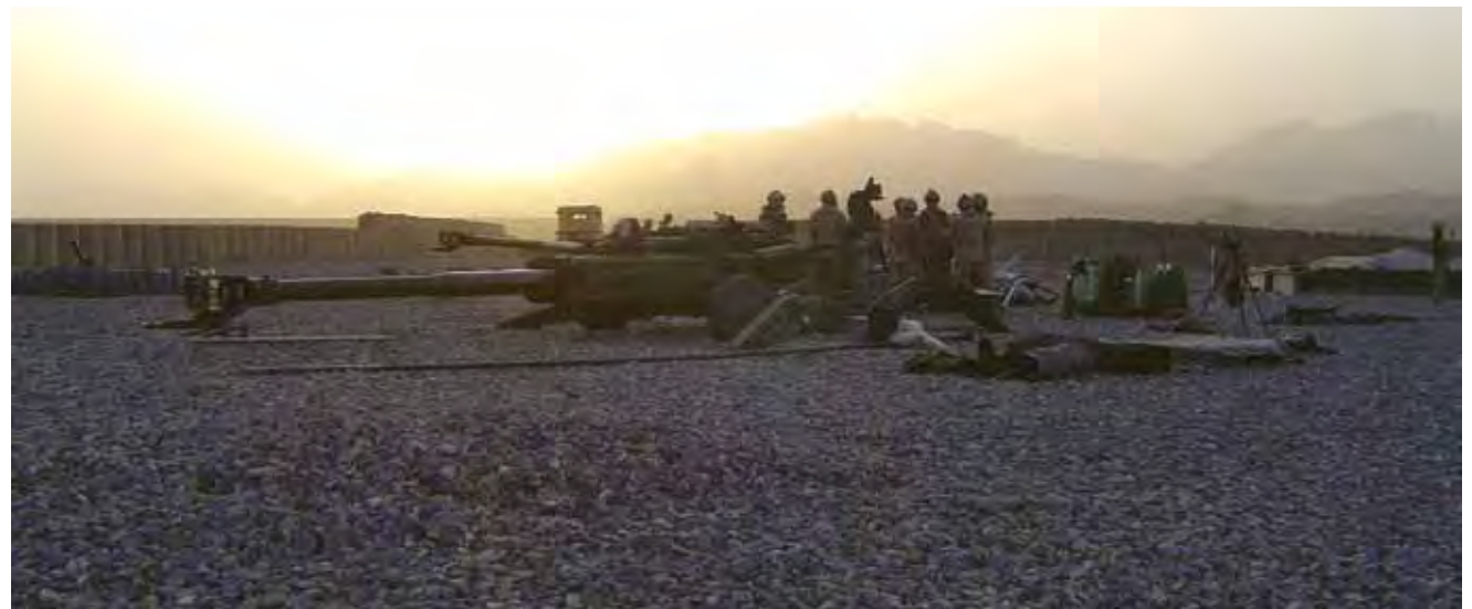
Artillery gun detachment members prepare for a fire mission in support of a 2 PPCLI BG combat mission.