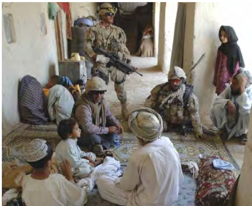
The Squadron Commander during a meeting with local Afghans during the operation.

And this operation enabled us to keep busy in order to gradually bring us closer to our departure date from Afghanistan.