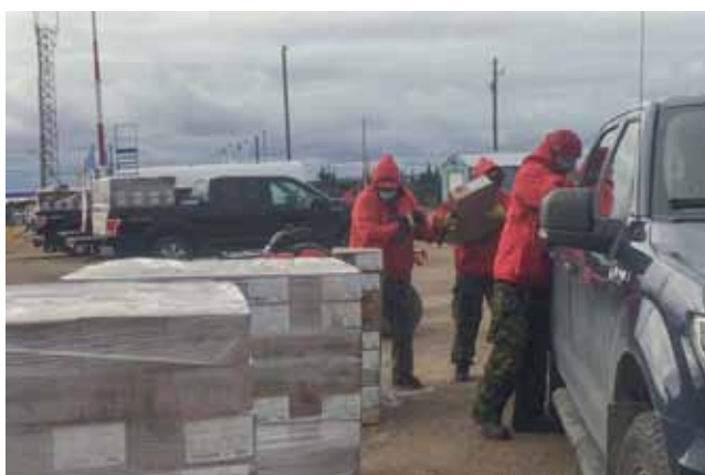
Members of the Lac Brochet Canadian Ranger Patrol load up food parcels and prepare to deliver to community members in Lac Brochet, Manitoba on October 3, 2020 part of the Canadian Surplus Food Rescue Program.