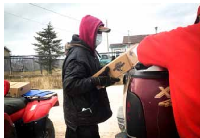
Members of the Lac Brochet Canadian Ranger Patrol load up food parcels.