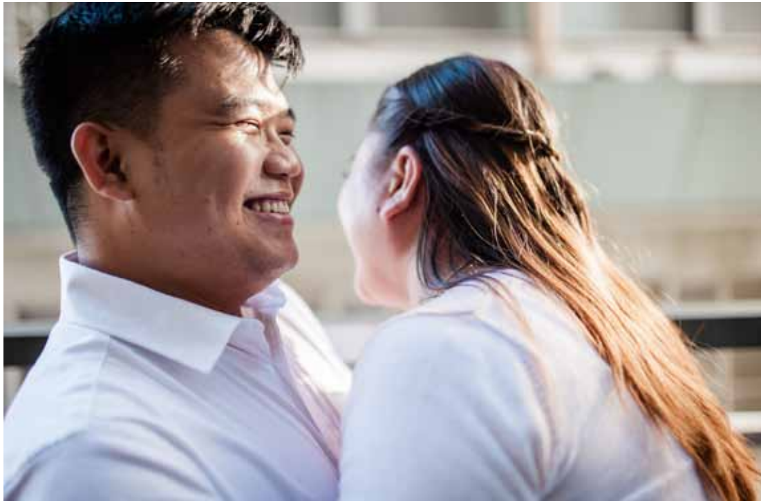
Laughter boosts our immune system. It's good for you and those in your immediate family circle!