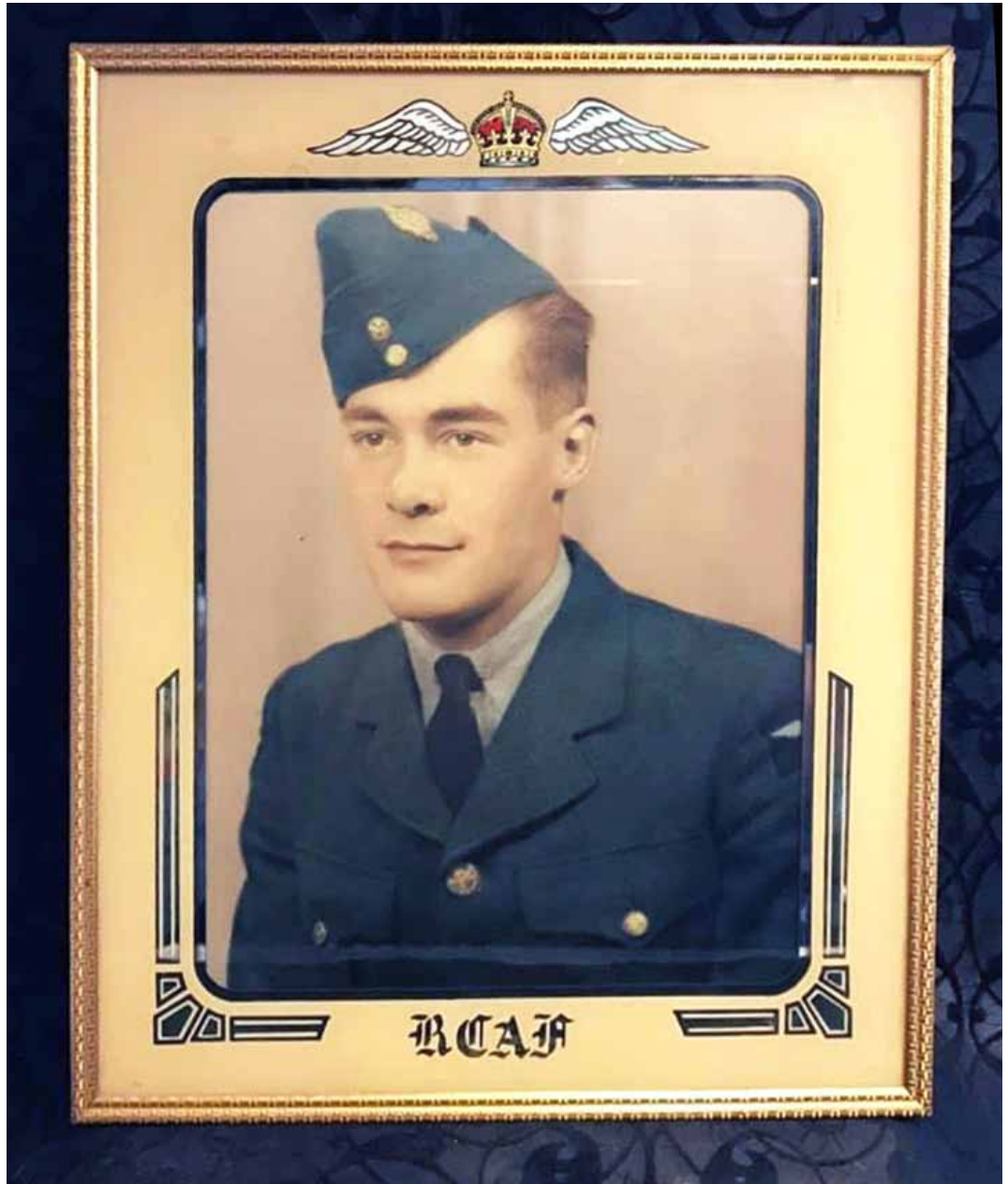
Do you know who this might be?

But, he said, those files were lost in a fire several years ago.