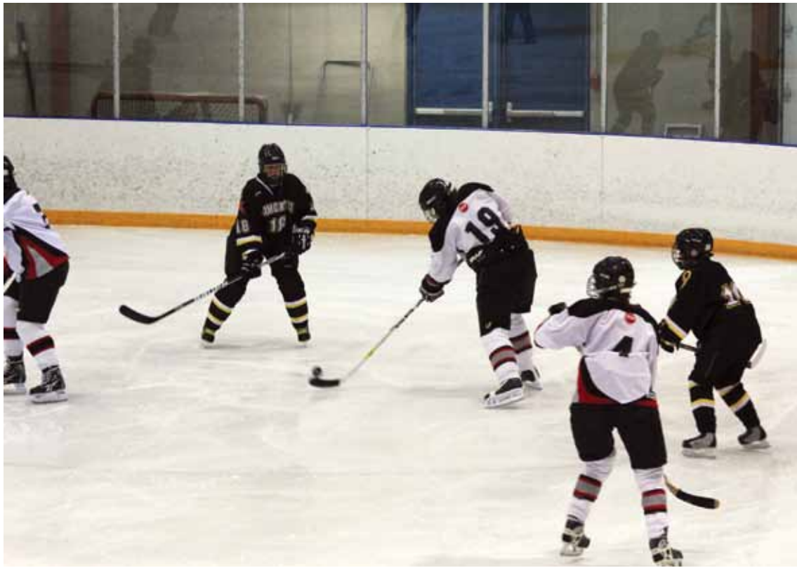
The 17 Wing Women's hockey team in action against the CFB Edmonton team.

"Then we turned up, and Edmonton was in the same boat as we were," says MCpl Lonny. "If we had stayed separate teams, it probably would have been us with 8