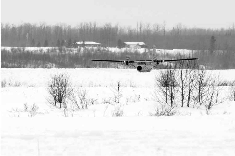
A CC-138 Twin Otter from 440 Squadron 17 Wing Yellowknife lands at the Cochrane Airport during Exercise TRILLIUM RESPONSE.